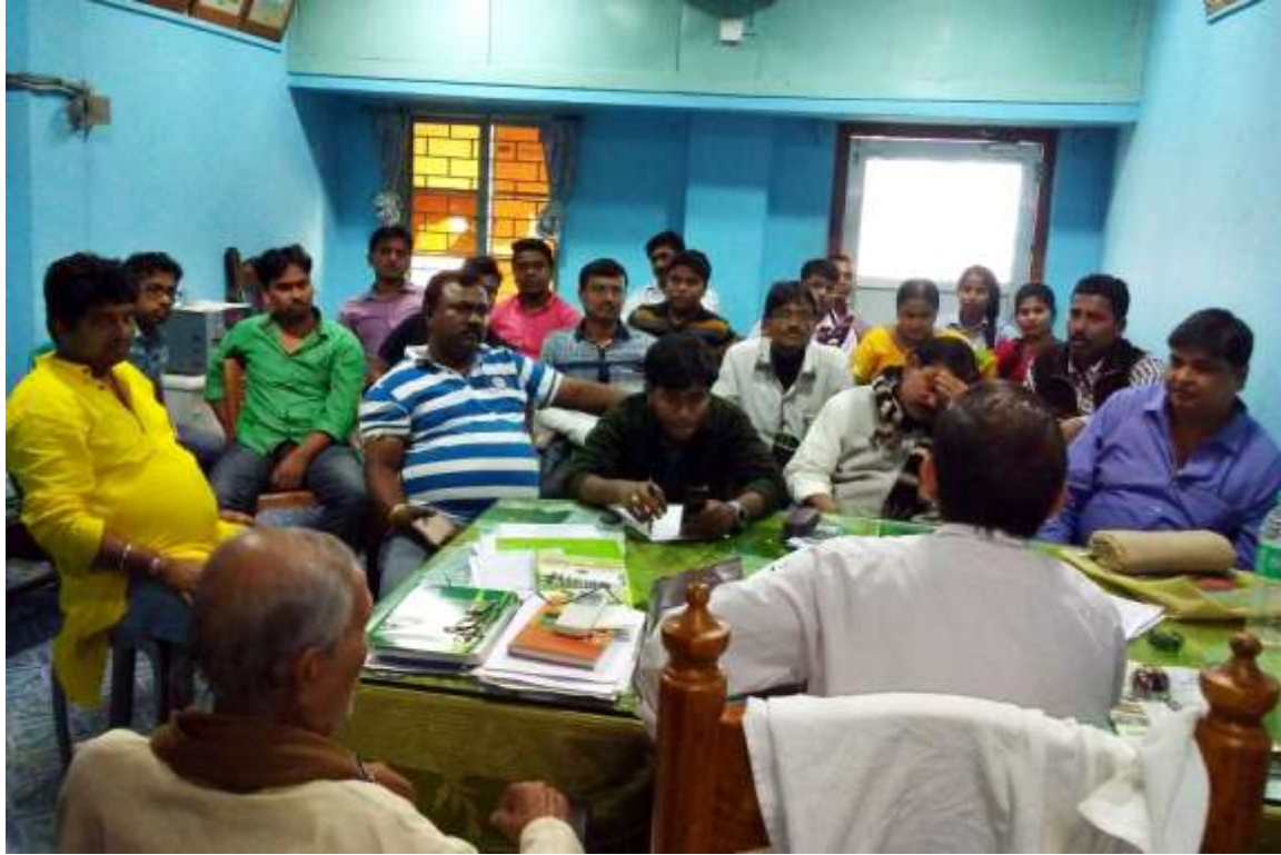
Photo of one of the meetings of the Alumni held on 2016.

The resolution copies of the alumni meetings during last five years have been attached below showing the activities of alumni for the development of the institution. This is actually a report of the alumni association in their meeting.